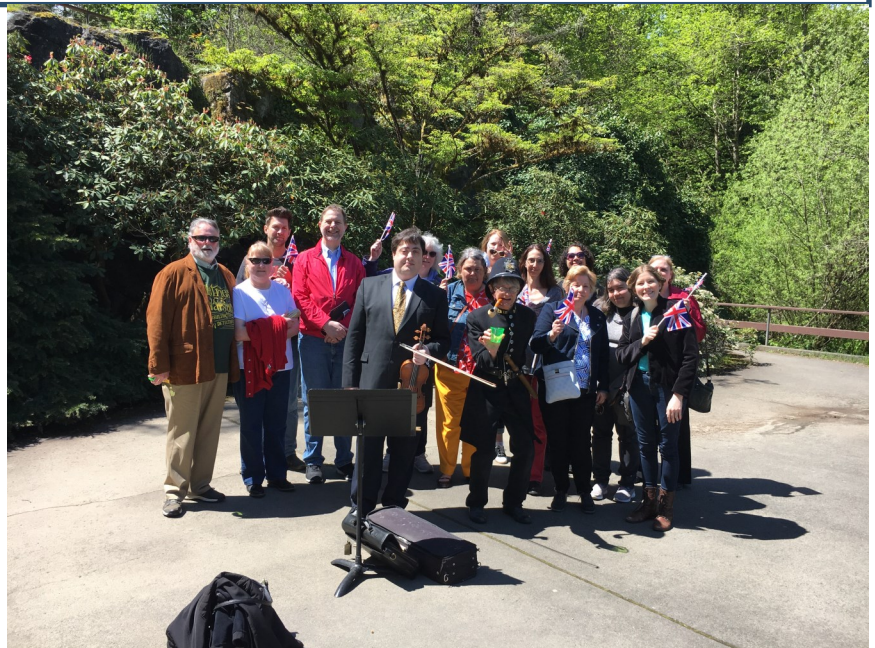
The Sound of the Baskervilles and friends in Tumwater, Washington for the 2017 Wreath Throw event!