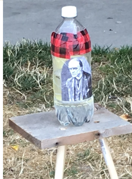
Pictured: The malevolent Professor watches us from his perch on a stool, as we get ready to try to knock him over!