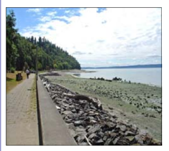
No, we could not see the parking lot or restrooms from our shelter!!