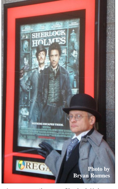
James gave the new "Sherlock Holmes" film a "3 calabashes out of 4" rating!!